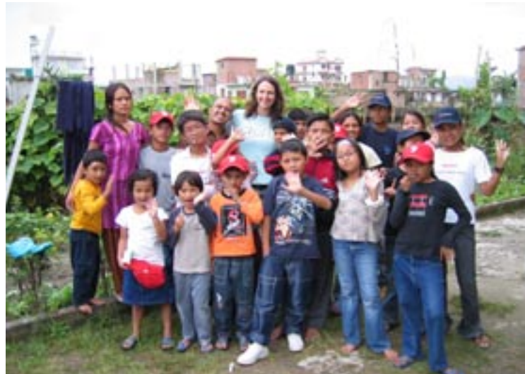
All dressed up for the footy